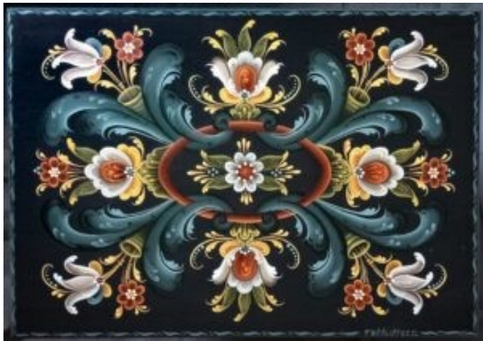
American Rogaland Rosemaling

Norwegian rosemaling continued its westward migration all the way to America. Emigration was heavy from some of the areas where rosemaling was well established. Travelers packed beautifully rosemaled trunks to make their journey across the Atlantic. Well-known as well as lesser known painters traveled to the New World.