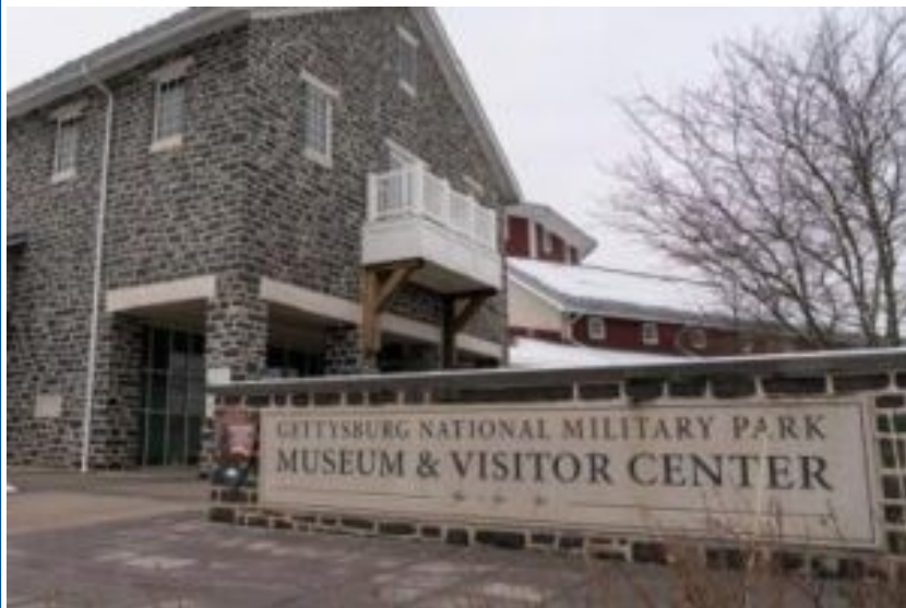
From the Explore York website