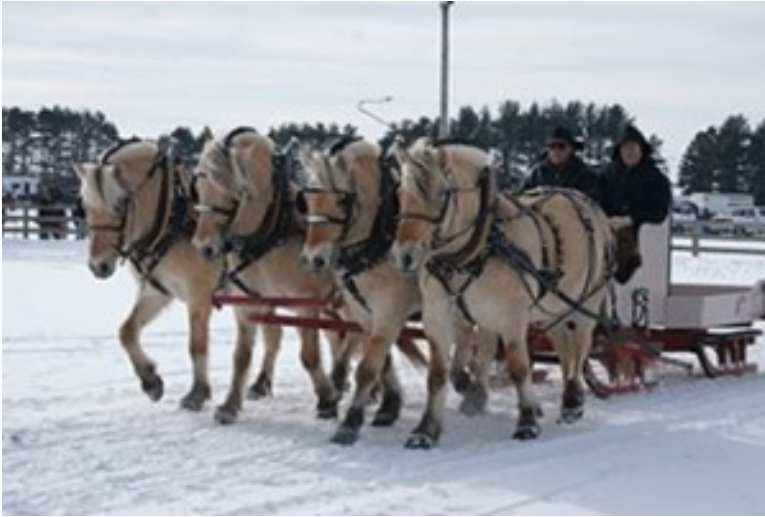
Pete Markham, CC BY-SA 2.0 < https://creativecommons.org/licenses/by-sa/2.0 >, via Wikimedia Commons