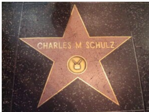
Schulz's star on the Hollywood Walk of Fame.