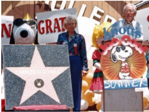
Schulz receiving his star on the Hollywood Walk of Fame at Knott's Berry Farm in June 1996

At its height, Peanuts was published daily in 2,600 papers in 75 countries, in 21 languages. Over nearly 50 years, Schulz drew 17,897 published Peanuts strips. The strips, plus merchandise and product endorsements, produced revenues of more than $1 billion per year, with Schulz earning an estimated $30 million to $40 million annually. During the strip's run, Schulz took only one vacation, a five-week break in late 1997 to celebrate his 75th birthday; reruns of the strip ran during his vacation, the only time that occurred during Schulz's life.