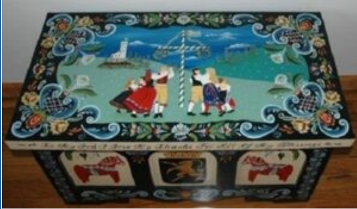
Norwegian Rosemaling on a chest[