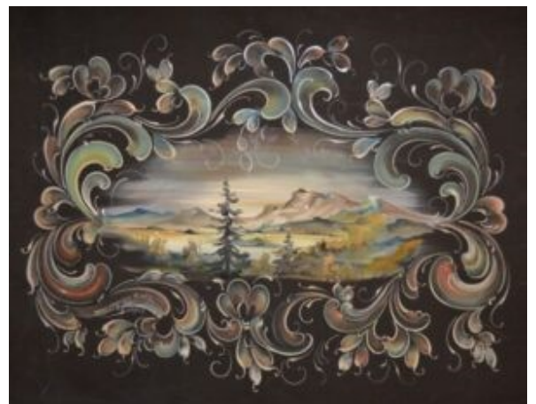
Norwegian Rosemaling Telemark Style