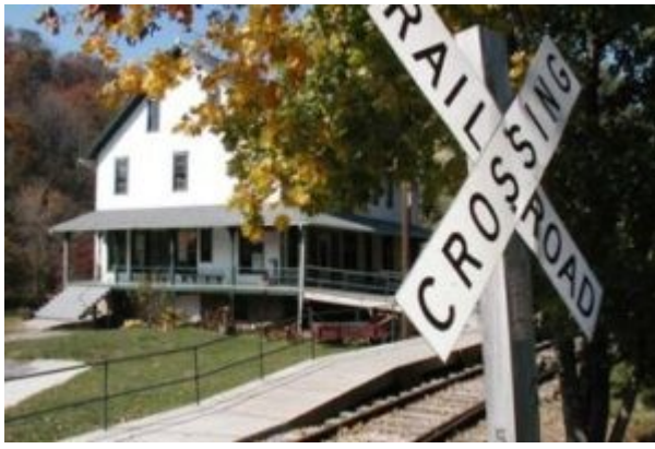
From the Explore York website

Step back to 1915 when the railroad was at the center of village life. Costumed interpreters welcome you to the M.M. Grove General Store , mill and grain elevator. Motorcar trains offer a 5 mile trip through the scenic Muddy Creek Valley on the mail line of the famous Ma & Pa Railroad.