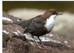
The national bird is the Dipper.