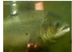
The national fish is the cod.