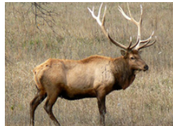
The national animal is the elk.