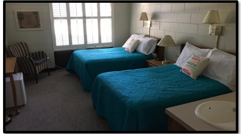
DOUBLE ROOMS —Sleeps up to 4 people per room. 10 available.