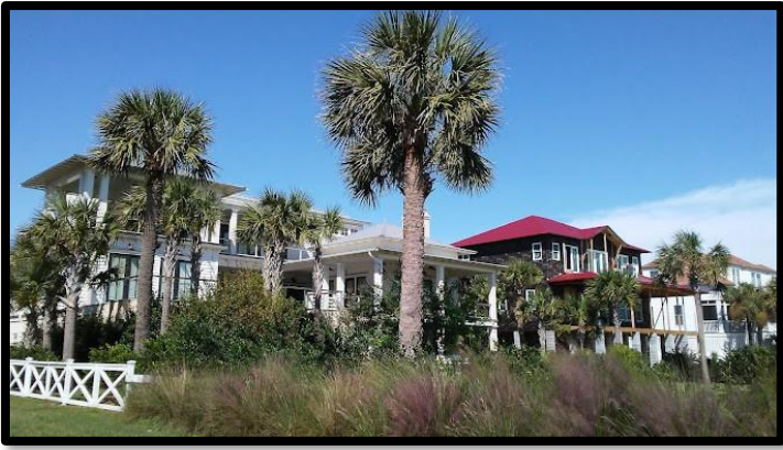
COVERED BACK DECK — Perfect area for relaxing, quiet time or meeting space