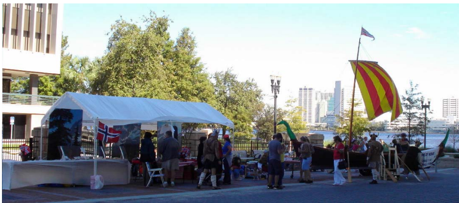
Gateway to Florida Lodge tables laden with fresh Norwegian bakery and merchandise; Loki the lundehund, a live viola concert, Hagar the Viking boat & Vikings attracted hundreds of curious people to their Norway display.