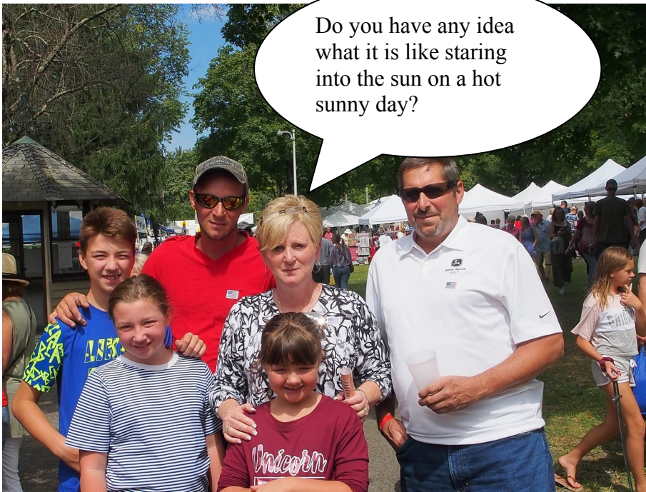
The Budricks – Viking Mountain Lodge